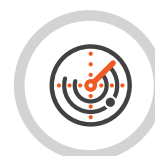
PCI Compliance Scan (ASV-PCI)