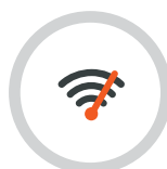
Wireless Penetration Test