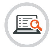
Application Source Code Assessment