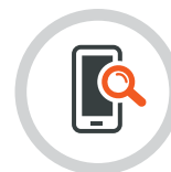
Mobile Application Assessment