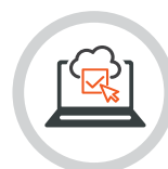
Web Application Penetration Test